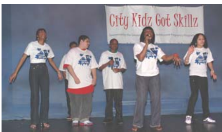
GBAPP's Life Choices Students performing original rap, "Don't Do Drugs".

With hip-hop as the impetus behind the showcase, this two day event focused on positivity and empowering youth to express themselves through the arts. Over 60 talented youth had the courage to step into